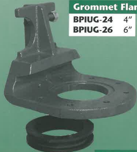
Grommet Flange BPIUG-24 4" BPIUG-26 6"