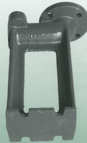
Base Elbow BPIU-12 2"