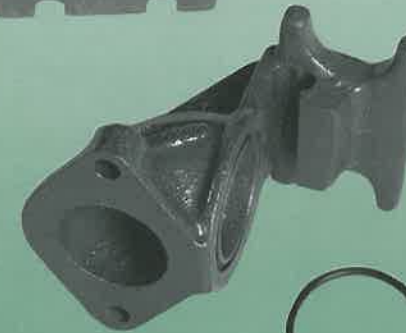
Discharge Flange BPIU-22