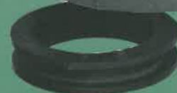
Grommet A-471 4" A-920 6"