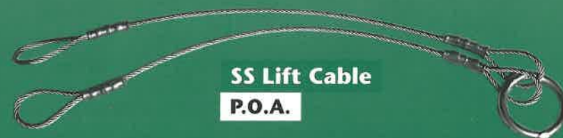
SS Lift Cable P.O.A.