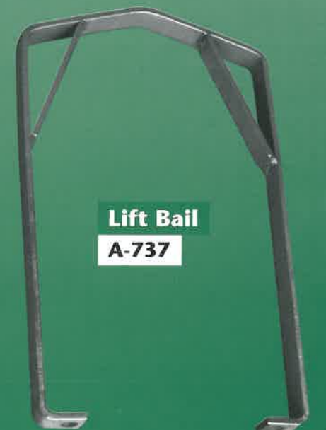
Lift Bail A-737

ALL BPI RAIL SYSTEMS COMPONENTS ARE ADAPTABLE TO MOST FOREIGN AND DOMESTIC PUMPS