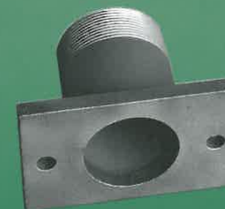
Pump Adapter A-871 2"