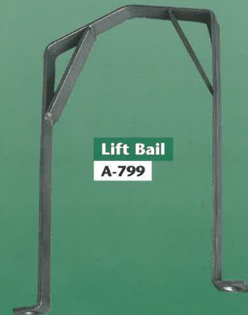
Lift Bail A-799