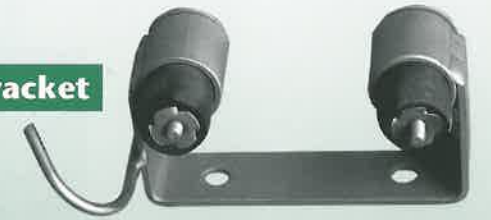
Upper Guide Bracket BPIU-914