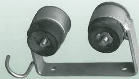
Upper Guide Bracket BPIU-34 4" BPIU-36 6"