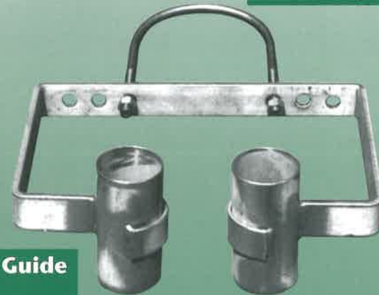
Intermediate Guide Bracket BPIU-44 4" BPIU-46 6"