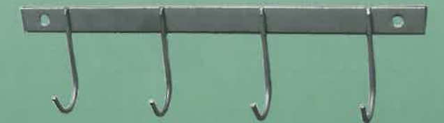
4 Hook Cable Holder A-985